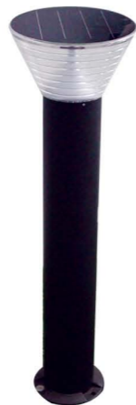
REF : CPD3004 5V - 5W IP44