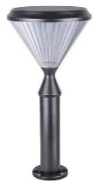
REF : CPD5405 6V-3W IP44