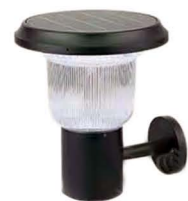
REF : BD 1104 6V-4,5W IP 44