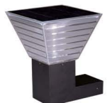
REF : BD6001 5V-5W IP44