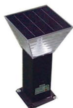
REF : CPD5004 5V-5W IP44