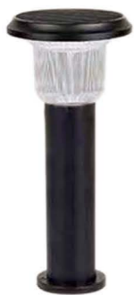
REF : CPD2204 6V-4,5W IP44