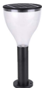
REF : CPD4804 6V-3W IP44