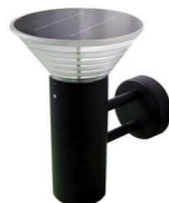
REF : BD3304 5V - 2W IP44